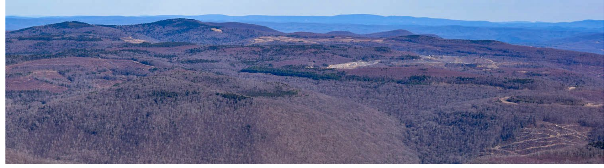
Rocky Run Surface Mine visible in the foreground with Point Mountain and Sugartree Bench Mountain in the background. Cranberry lies just beyond the two mountains.

Part two in this series found in the October issue of the Voice provided a brief overview of the harmful impacts that a handful of strip mines and coal haul roads operated by one company, South Fork Coal Co., are wreaking in the Laurel Creek and South Fork of the Cherry River-watersheds that are designated occupied critical habitat for the most important remaining metapopulation of candy darters.