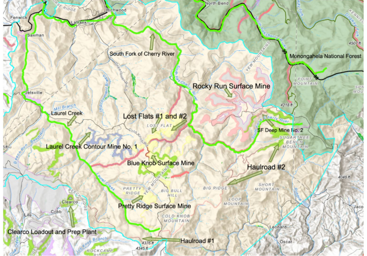
Map of South Fork Coal Company operations that impact candy darter critical habitat. Impaired streams are shown in red, critical habitat shown in lime green. (Allegheny-Blue Ridge Alliance's Coal Operations in Candy Darter Habitat Conservation Hub Site)

that would otherwise violate Section 9's take prohibition. However, if the terms and conditions of a biological opinion and incidental take statement are violated, agencies and private actors are exposed to take liability.